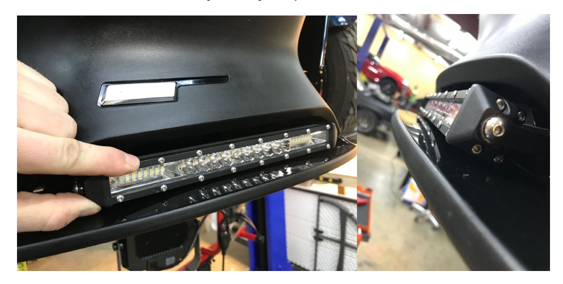
10.- next plug the Light Bar power cord into the switch. Run the wire back up to the switch like you ran the switch power wire down to the accessory power plug.

9.- Next Install the Light Bar with the two screws provided. Adjust the light bar so the light point level. You may adjust it to your specific needs.