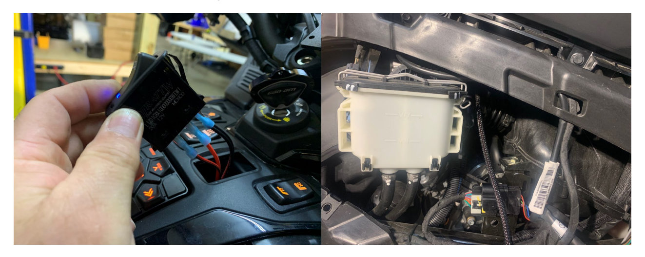
6.- Next remove the front panel shown below. Keep the two screws. Locate the factory accessory wire and keep it out in the open. Remove the plastic panel from the oem connector.

5.-Locate the blank switch plate on your RT. Remove that blank plate and route the switch power wire down though the upper area to the side panel accessory wire locations as shown below. Plug the Y-Adapter into the accessory plug shown above then plug the switch wire into the Y-Adapter. We HAVE SUPPLIED A REVESE POLARITY CABLE AS SOME RT MODELS THIS WIRE WAS WIRED BACKWARDS FROM FACOTRY. ONCE COMNNECTED IF YOUR LIGHT BAR DOES NOT WORK USE THE REVRESE POLARITY CABLE BEWTWEEN THE (Y-ADAPTER) AND PLUG TO LIGHT BAR. The remaining end of the adapter can plug back into the original accessory wire location. Do not snap the switch in into the panel yet.