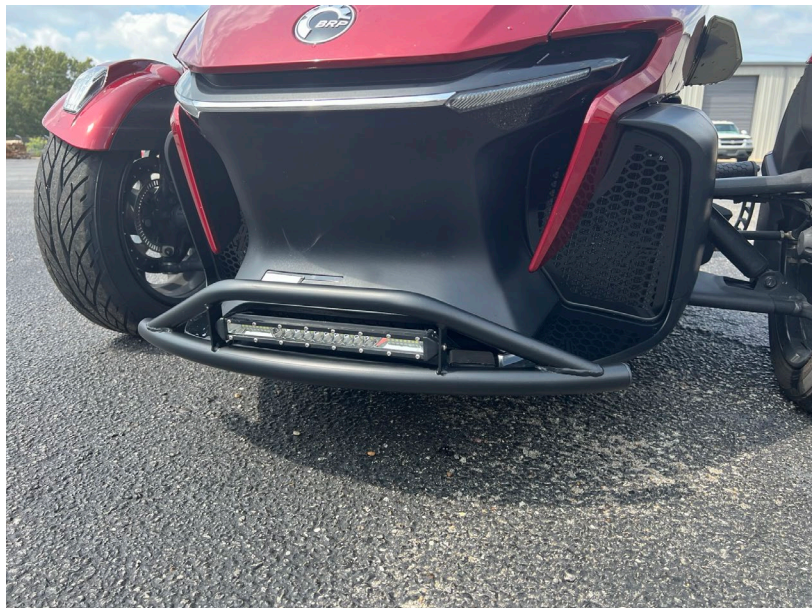
Shown with Optional LED Driving Light SRT20+DLB