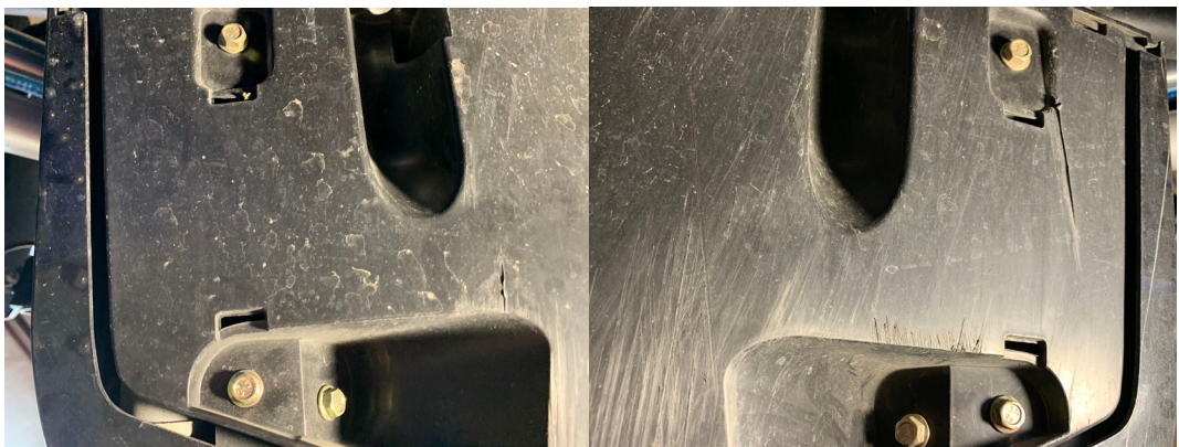
Underside view of a typical F3

1.- Installing the new Bumper is simple. Only four bolts! First remove the LOWER 4 factory 6mm bolts as shown below. These are the two outside bolts each side.