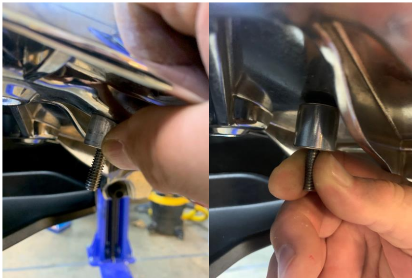
Angle Spacer Location

4. The mount requires two spacers. The outside spacer on the left floorboard is angled to follow the floorboard. The inside on the right floorboards uses the angled spacer. The larger one goes on the inside bolt on the left board and the outside bolt on the right side. These are the bolts holes you drill.